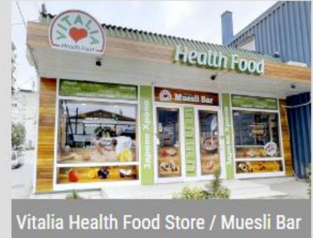
Vitalia Health Food Store / Muesli Bar