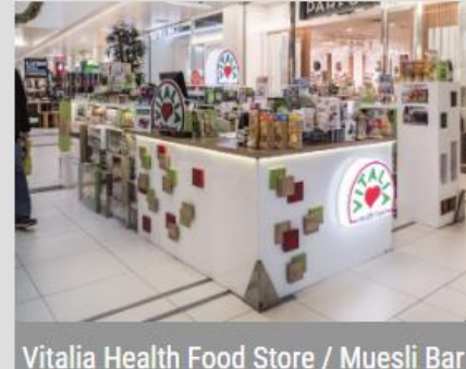
Vitalia Health Food Store / Muesli Bar