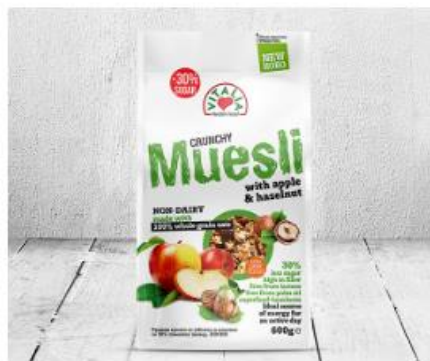
Muesli Crunchy Apple Hazelnut