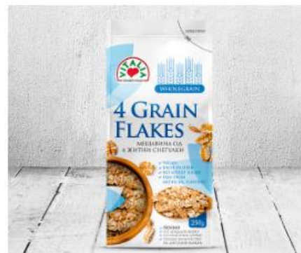
4 Grain Flakes