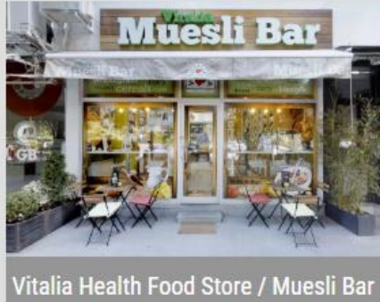
Vitalia Health Food Store / Muesli Bar