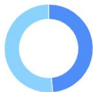
Gender Distribution ⓘ