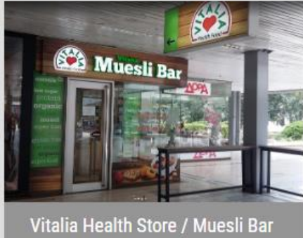
Vitalia Health Store / Muesli Bar